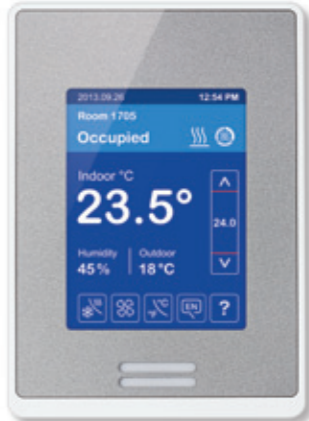
As shown: white cover, glossy translucent silver fascia, and blue touch screen