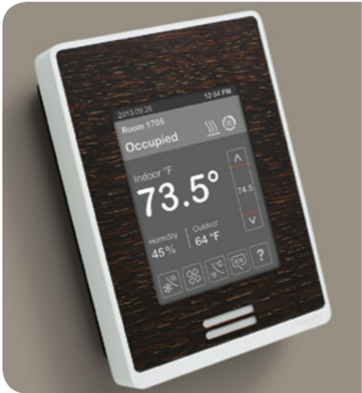
As shown: white cover, dark brown wood fascia, and dark grey touch screen

The touch screen provides the flexibility to easily customize the information being presented to your guests, such as a customizable welcome message or logo.