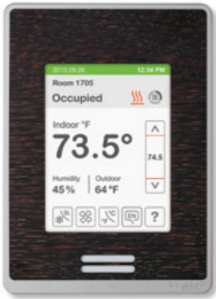
As shown: silver cover, dark brown wood fascia, and white touch screen