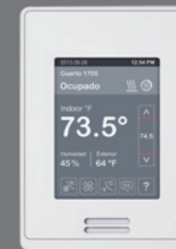
Grey touch screen with Spanish language