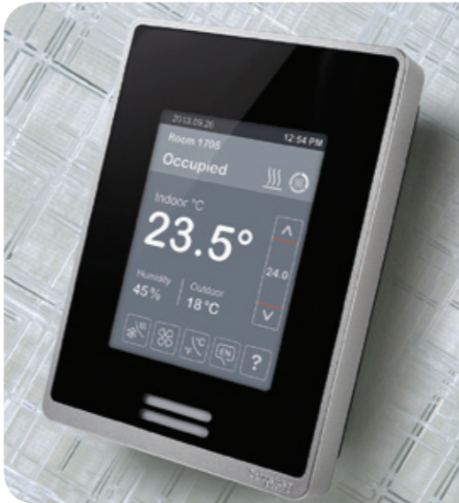
As shown: silver cover, glossy translucent black fascia, and grey touch screen

A comfortable environment fosters optimum employee performance. Fewer distractions from uncomfortable temperature variations means more productivity.