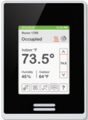
As shown: white cover, glossy translucent black fascia, and white touch screen

Save your space from monotony with our stylish room controller, adorned with a bold and glossy finish. Whether you are introducing a luxurious theme or are attracted by more eclectic decor, you will be creatively inspired by the ability to accentuate modern furnishings and styles. Our selection of bold finishes and textures will visually entice and impress your guests.