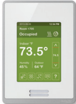
As shown: silver cover, glossy translucent white fascia, and green touch screen