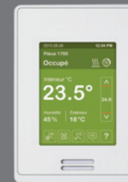
Green touch screen with French language