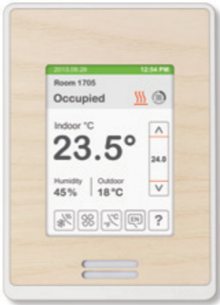
As shown: white cover, light tan wood fascia, and white touch screen

Introduce a natural ambience to any decor by bringing outdoor elements into your space. Our selection of light tan, dark brown, and black wood finish fascias offer stylish options combined with the warmth of wood. By mixing the fascia colour palettes with our customizable screen colour schemes, you can achieve the perfect variation to create your own personal statement.