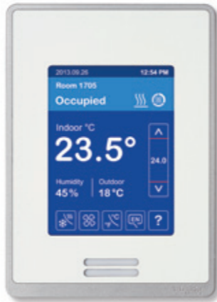
As shown: silver cover, white fascia, and blue touch screen

All these features are offered with the sole purpose of lowering installation costs, minimizing downtime, and accelerating the return on investment for building owners and facility managers.