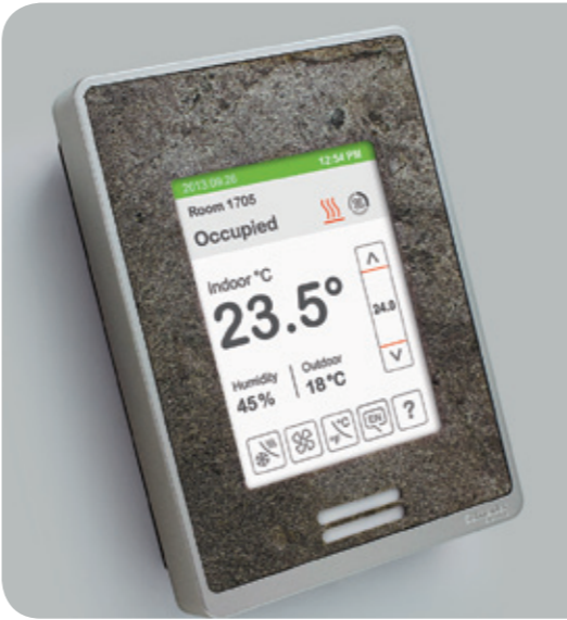
As shown: silver cover, light grey slate fascia, and white touch screen

An enjoyable customer experience begins with comfort. You no longer have to compromise comfort for energy savings. Our reliable control functions allow you to achieve both simultaneously.