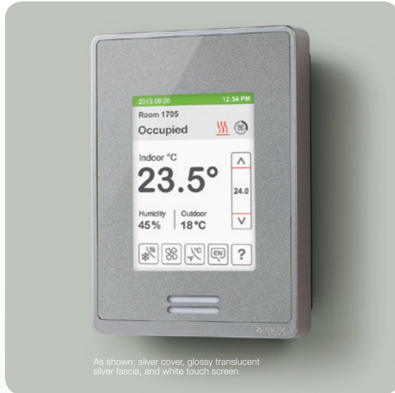
As shown: silver cover, glossy translucent silver fascia, and white touch screen

We understand that usability is important to our customers. The SE8000 Series also focuses on providing a comfortable user experience in environments where the occupant expects a bit more. The SE8000 Series' elegant design and fully customizable touch screen display allows upscale hotels, corporate offices, and high-end retail stores to offer an unforgettable user experience. Harmonizing our controller with your brand image — or the unique tastes of your guests — has never been easier.