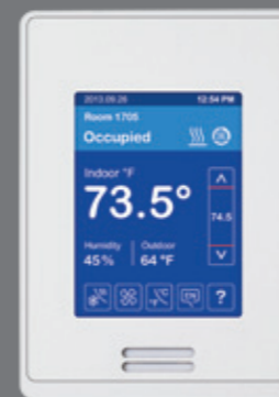
Blue touch screen with English language