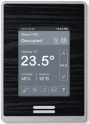
As shown: silver cover, dark black wood fascia, and grey touch screen