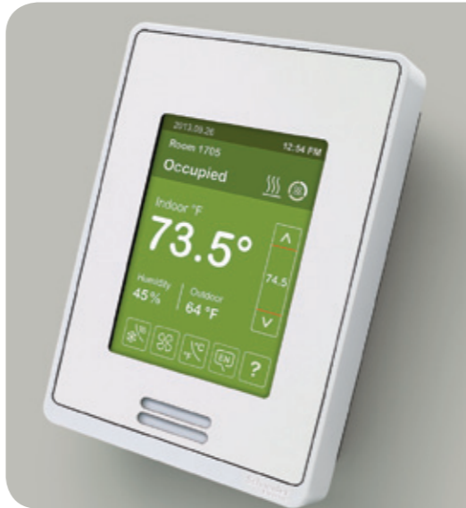
As shown: white cover, white fascia, and green touch screen

Less downtime means minimal disruption to operations, less unoccupied rooms for hotels, and uninterrupted class schedules for educational facilities.