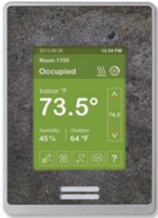
As shown: silver cover, light grey slate fascia, and green touch screen