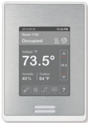
As shown: white cover, brushed aluminium fascia, and dark grey touch screen

By combining our extensive palette of colours, textures, and finishes, your personal style and creativity options are unlimited.