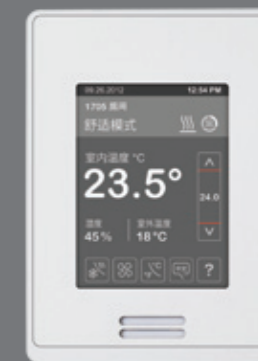
Dark grey touch screen with Chinese language